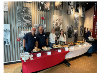
Feeding Our Heroes proudly joined for multiple onsite events in 2025.