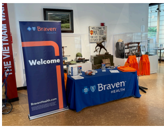
The Horizon Foundation and Braven Health were key sponsors in 2025.